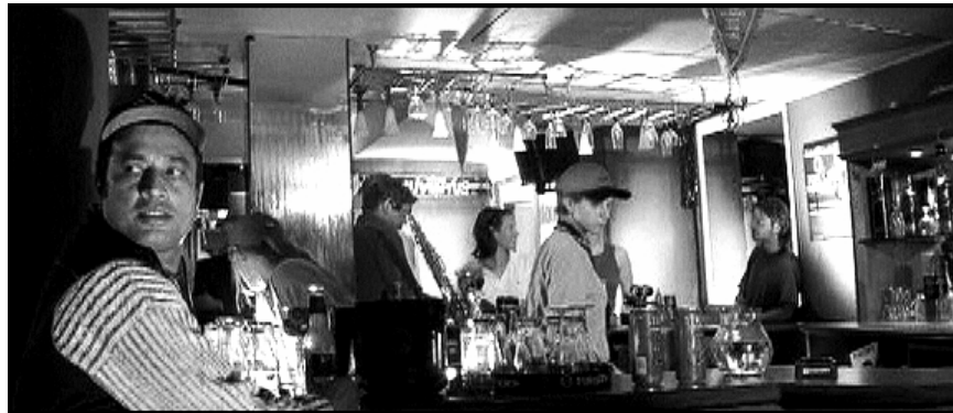
Figure 4. Followed by an inside shot of McDonald's: Kunwaara

dictions. Here we would like to indicate the dilemma of the few commercial films of this last decade that have turned their attention to Bombay as a site of collective action. One of these is phir bhi dil hai Hindustani /Ultimately We Are Indian (Aziz Mirza, 2000). Very much in the tradition of the nineties films, its central characters are young people--television reporters, whose ambitions are centered on making and spending money. However, they are disillusioned by their consumerist lifestyle and come to fight for the life of a man wrongfully sentenced to death by a corrupt government. At the end of the film, they get people out into the streets to prevent the hanging—and this is where we see Bombay again. While the imagery is strongly nationalist—with people waving flags—nationalism is interpreted as the ability of people to organize and act politically and take charge of the nation , to set it back on the original promise written into the constitution: secular, socialist, de-