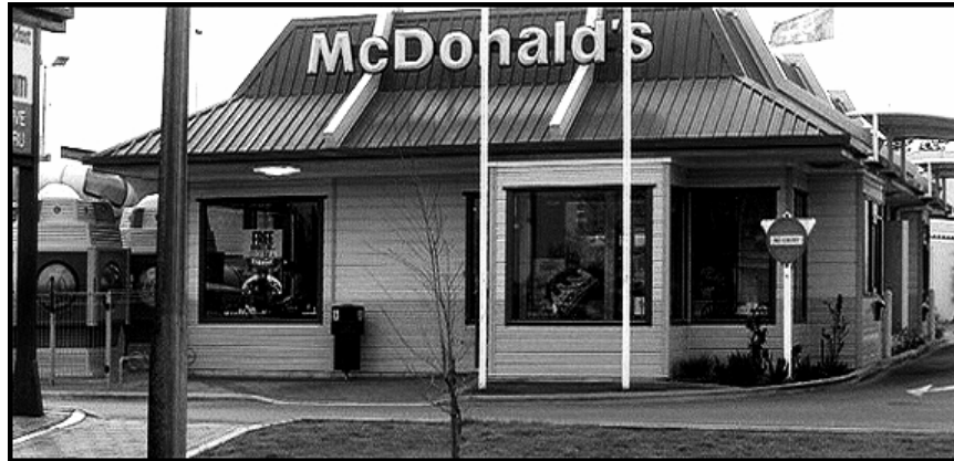
Figure 3. Opening shot establishes the location as a McDonald's: Kunwaara .