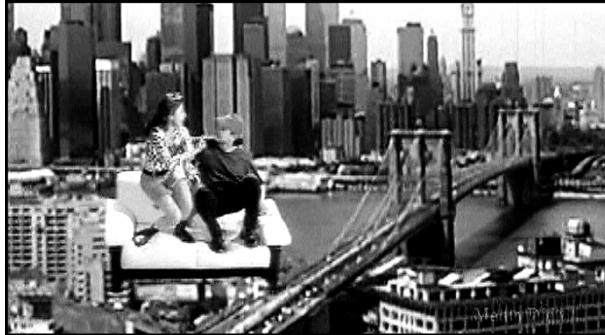
Figure 2. The lovers fly over New York City: Rangeela

of these new film-homes continued to be as fantastical as before but with two added features: a swimming pool in the living room and, if there was a child character in the film, a playroom filled up with cuddly toys. The playroom invented the child as a consumer, with its own room and possessions, while the swimming pool launched the new image of the large extended family--as fun-filled and open to consumption rather than authoritarian and constraining, one disciplined for production. The patriarch in this new fun-filled family is still tied to the disciplinary regime of production—the industrialists and their elder sons still run the businesses—but the women, children and the grandparents revel in an endless celebration of rituals and merrymaking.