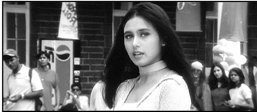
Figure 1. The college courtyard in Kuch Kuch Hota Hai flanked by balloons and Pepsi.

working class immigrants experienced in Bombay. In the end, the criminal brother would be killed. However, his end would be mourned as the death of a brave and ultimately honest man whose poverty and social alienation had forced him into turning violent. In the recent Kaho na Pyaar hai /Tell Me That You Love Me (Rakesh Roshan, 2000), this motif is updated. The film's protagonist is killed and his beloved finds his look alike, not brother, in far away New Zealand. Furthermore, the story stays clear of situating the protagonist's dilemmas in social circumstance. Instead, the film is cast as a psychological thriller setting up individuals as driven by their internal psyches rather than their social situations. The fictitious world of Bombay film was beginning to get smaller, atomistic and privatized!